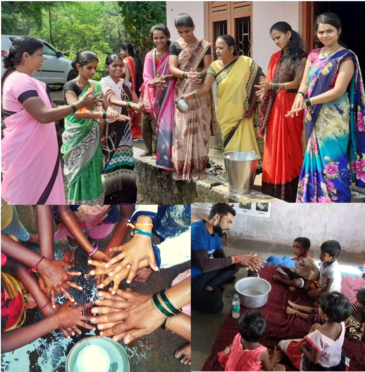
Team demonstrating steps of handwashing

This year, we are focusing on preventing the incidences of malnutrition among children through promoting proper nutrition and care for pregnant women, enrolling them for institutional deliveries, providing critical information regarding breastfeeding, etc. Healthy mothers and healthy babies are important for our communities, our economy, and our future.